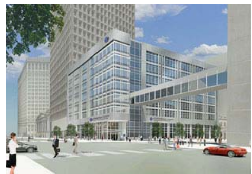
Rendering of the New Cuyahoga County Headquarters

A real estate consultant was selected to review this inventory and recommend dispositions: to reinvest in and upgrade; divest from; or simply maintain each of the 66 individual assets based on the asset's individual state and function within county operations. Those various recommendations revealed that the county could potentially save $84 million over 20 years through consolidating operations at a new headquarters and acquiring dedicated storage facilities. Savings was not the only significant factor to push toward consolidation. The county also had a desire to shape the neighborhoods where 13 buildings were offered for sale while having a positive impact on the surroundings of a proposed headquarters site.