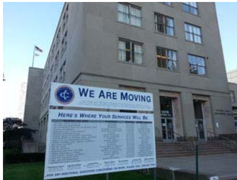
Ontario Street entrance of the Old County Administration Building

properties, with more than 650,000 rooms, in 90 countries and territories across the globe. The hotel will feature underground links to both the Cleveland Convention Center and the Global Center for Health Innovation and boast approximately 55,000 square feet of meeting space, a full-service restaurant, lobby bar, and recreation facilities that will include an indoor pool and fitness center. The new full-service convention center hotel is expected to begin construction by the end of this year and is scheduled to open by 2016. Finally, the project is expected to employ 2,800 workers on the construction job and between 450 to 500 people full-time at the hotel.