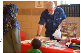
Recognizing National Preparedness Month

Cuyahoga County and the YMCA of Greater Cleveland teamed up earlier this month to celebrate National Preparedness Month and provide information for constituents at an event in Warrensville Heights. Preparing for an emergency ahead of time can make a huge difference for families. Knowing what to do and having a few essential supplies can help everyone cope with disaster